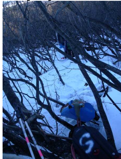
Traveling through the Alders

That night we camped in usual style up on the large bench with a view of the lights of the Valley and Anchorage off in the distance. ACS cell phones work well here, but ours was not an ACS phone, so we couldn't call home.