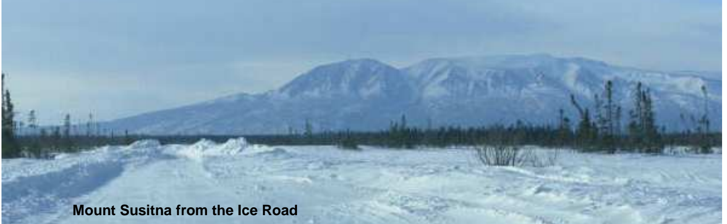
Mount Susitna from the Ice Road

After paddle climbing Mount Susitna three times in summer I was eager to see the mountain in its March glory. On March 15 Dan Byrnes and I took advantage of the cold winter of '06-'07 to get the good ice to Mt. Susitna. The ice road that was in the news was a subject