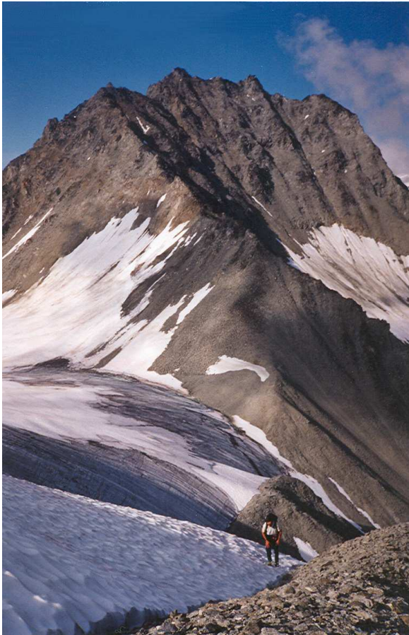
Tyrant's Tor Looms behind Bill Spencer as He Returns to Point 7450

Mountain Range: Talkeetna Mountains Borough: Matanuska-Susitna Borough Drainage: Sheep River Glacier and East Fork of the Kings River Latitude/Longitude: 62° 1' 34" North, 148° 32' 41" West Elevation: 8150 feet Prominence: 800 feet from White Knight (8450) Adjacent Peaks: White Knight, Peak 7750 near the Sheep River Glacier and the Middle Fork of the Kings River, and Peak 6650 near the East Fork of the Kings River and the Middle Fork of the Kings River