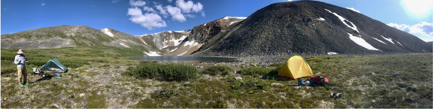
Base camp at tarn 4105.