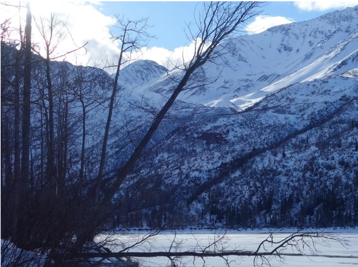
Bee's Heaven Peak, 6,385 feet, in Chugach Mountains. from south end of Eklutna Lake, March 1, 2002.