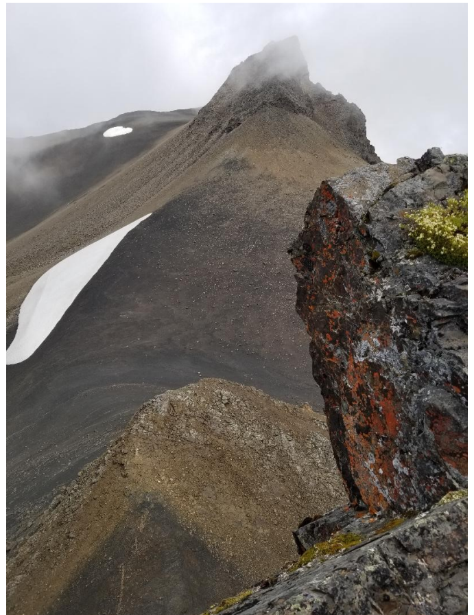
"Hmm, where'd this cliff come from?" The true summit is behind Point 6201, shown in the background.