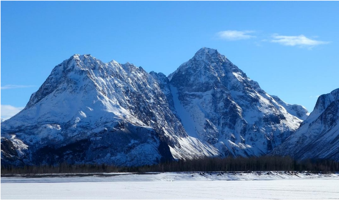
The Mitre, 6,651 feet, in Chugach Mountains.