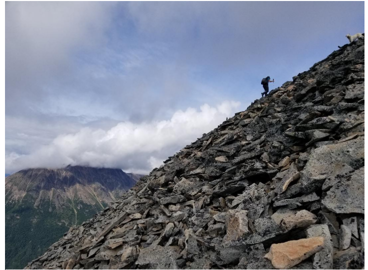
Chelsea Grimstad and Bean post-salad, pre-summit.

Fat stores were replenished at La Potato, the van tire was patched by placing it in a shack with some cash for Kaleb Rowland from Fireweed Airstrip to handle, and we all lived happily ever after.