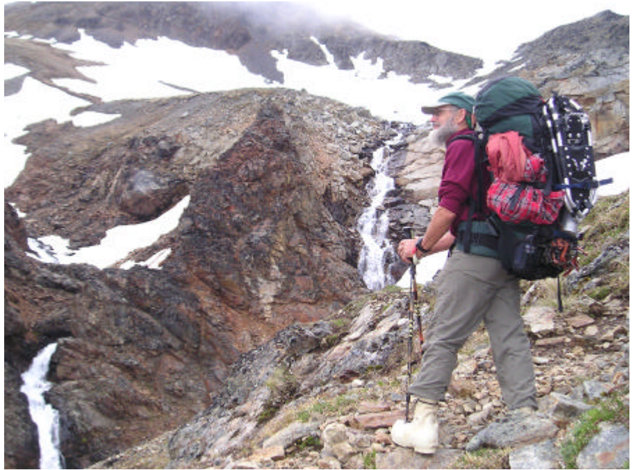
Think REI will take the boots back?