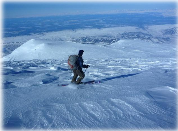
Luc Mehl skiing through sastrugi.

11,000 feet, her "flu" had advanced into a back-bending, stomach-grinding illness, which had come on surprisingly fast. Thinking back to the climbers who took 12 days on this mountain, our top speed attempting to climb within two days may have resulted in some relatively unexpected altitude sickness for Erica. So we decided to set up camp. With three-foot high sastrugi covering the whole upper mountain, it wasn't hard to hollow out a dwelling.