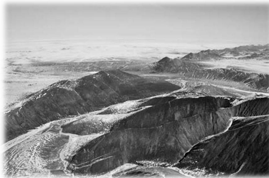
McCall Creek flows from left to right at the base of Marie Mountain and then hits the Jago River, near the center of the photo.