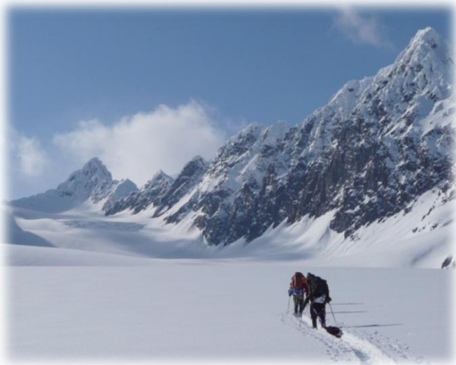
Approaching Camp Two on the Billiken Glacier.

About a mile west of Nellie Juan Lake we turned north and made slow, but steady, progress up moderate-angle slopes to higher ground. After contouring around several deep ravines, we soon saw the lake below us. There was a line of low clouds lying over the Ellsworth Glacier at the head of Day Harbor to the south, but that later faded away.