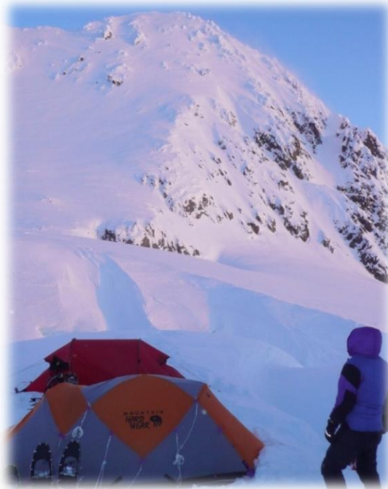
The summit of Hearth Mountain above camp at 5,300 feet.

On this our fifth day, we actually felt stronger than when we started. When the last water crossing was completed and we reached the highway, we were sorry the trip was over. It was a bit over 30 miles on a route that covered ground we have dreamed about for a long time, with one more sweet summit we can look up to with a smile, remembering our steps to the top.