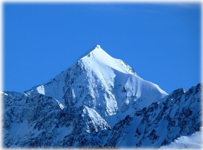
Hearth Mountain from near Primrose.