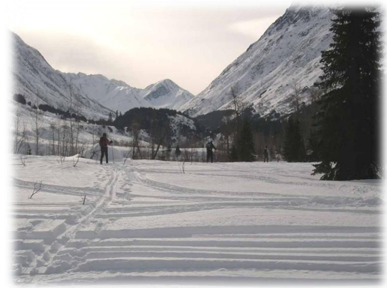
Skiiing up the valley toward Johnson Creek Summit.