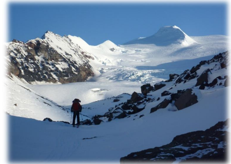
Luc Mehl skiing along the moraine of the Sheep Glacier with the north ramp of Mount Sanford in the background.

The ski descent was as straightforward as our climb. However, contrary to the usual ski descents where your legs get more tired the further you ski, we felt increasingly better the lower we got. Skiing through the large sastrugi, we took a few "hard-ass" falls. The sastrugi maze of snow walls also made finding our camp trickier within the large expanse of Sanford's northern flank, which in some places is more than two miles wide.