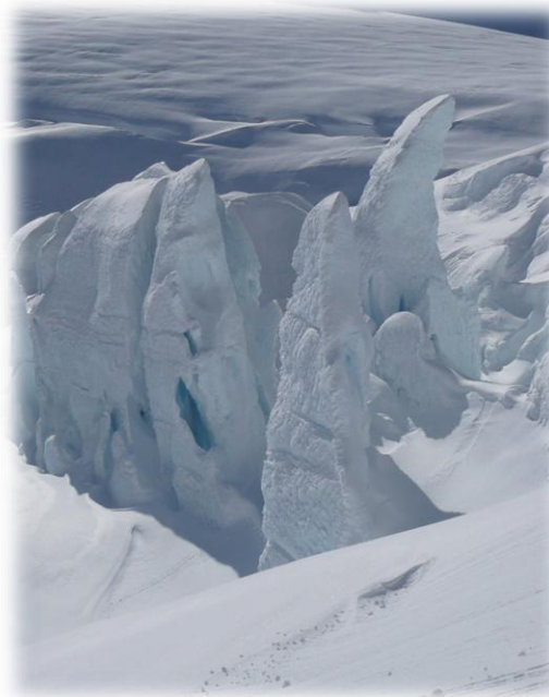
Forty-foot ice towers reminded us of billikens, the Alaskan lucky charm figure.

In the morning we geared up for glacier travel and moved in pairs – George and I with our sled, Dano and Tom with their gear. It was smooth going; no serious problems presented as we picked our way up past several areas of exposed ice. An amazingly beautiful hanging glacier on our left cut loose with one icefall avalanche as we passed nearby.