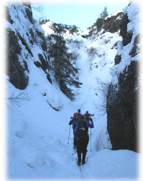
Center Creek gets steep and narrow.