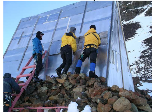
Hut Maintenance is a Frequent Occurrence

Day seven was our departure day. We were up at 6:00 and heading out at 9:05. Blue skies and sun were in order for the day. It was windy at Raven Pass. I had the group retreat out of the wind as Ray, Travis, and I checked out the headwall. The clouds in the valley were surging toward us. As we began our descent, we were enveloped in the fog, wind, and snow. We descended as though in a bottle of milk – zero visibility. My team waited in a safe area on the Raven Glacier and got an occasional look at the second team downclimbing. It was amazing that we had managed to avoid the three bergschrunds. As we made the south turn onto the Crow Pass trail we encountered increasing wind. The group stopped at the Crow Pass Cabin to eat, water up, and talk over the conditions. We decided to descend the probably avalanche-prone slopes. The snow conditions were crusty up high and rotten down below. Everyone was having a tough time skiing. It was slow going and John took a nasty fall off the trail but was OK. We made the parking lot by Glacier Gulch at 9:45 p.m.