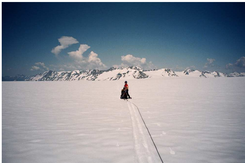
Laura takes a break

Solstice day! We awoke to sunny skies, a bit of haze, and a distinct smell of a forest fire (burning near Nikiski). We headed up towards 5912,' sussed it out, and decided to head up the west side. After making it over a couple of bergschrunds, it was just kicking steps in the steep snow to the top. What a gorgeous summit view—overlooking Resurrection Bay and the whole Icefield! Back at our camp that evening, we crashed early, excited to head up more peaks in the coming days.