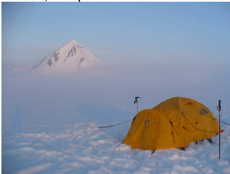
Peak 5910, route up the front center

At some point while skiing in the bowl of milk, I remembered the number for the NWS weather line. I asked Laura if it was worth $2 to her to call the line on our sat phone?! Sure enough, we busted out the phone and heard the dreary forecast. But, the sucker holes were still passing over often enough that we refused to give up hope. We set up camp at our GPS point and hit the hay early, hoping for the best.