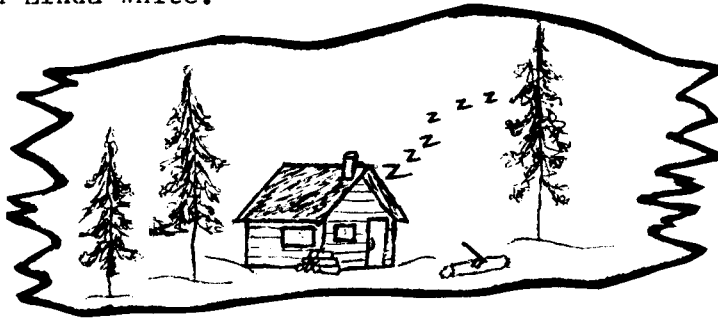
Phantom of Swan Lake