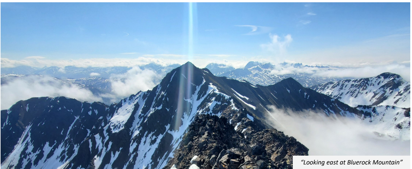
"Looking east at Bluerock Mountain"

This peak is slog, super easy just more than half of the day is spent balancing on boulders. This would be a fun early spring climb as it has couloirs on the NW face.