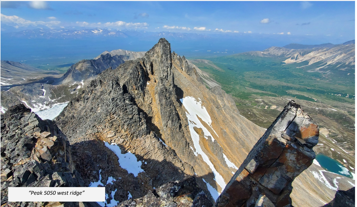
"Peak 5050 west ridge"