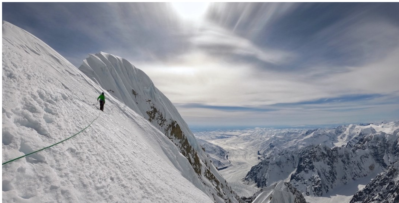
Scree— March 2023