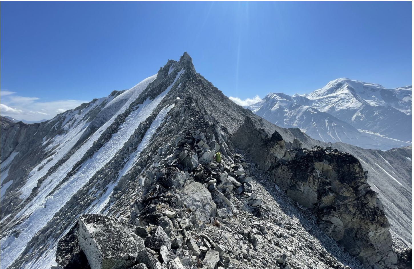
Scree— March 2023

If you are interested in how this project concludes, please look for my thesis presentation at UAF in the spring of 2024.